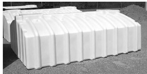
LOW PROFILE UNDERGROUND TANKS RKW SERIES